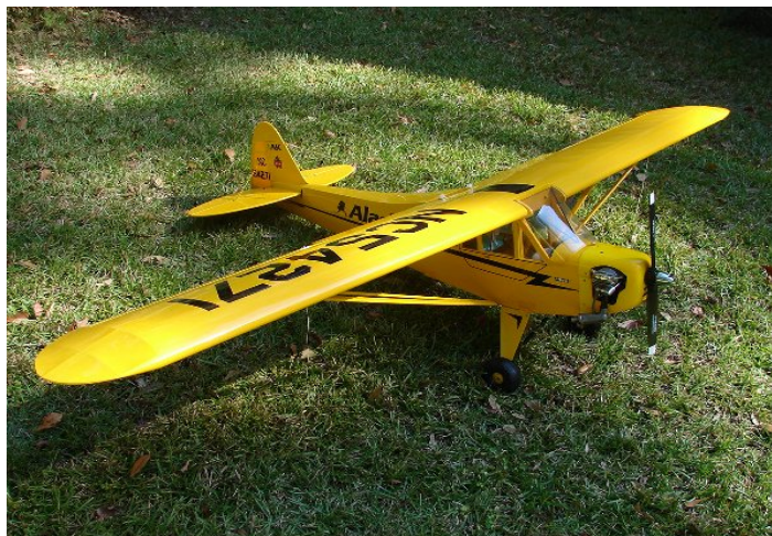
All better, back to normal.