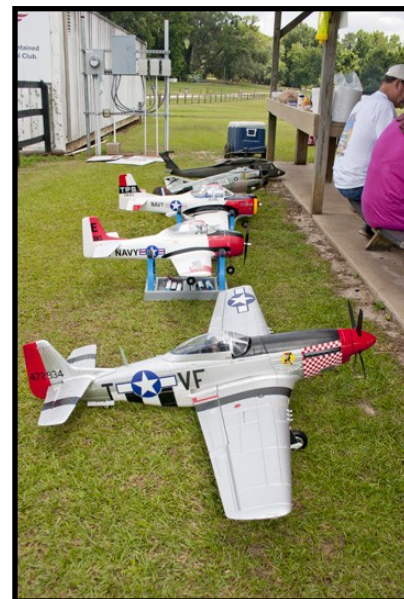
Warbirds lined up at our 2015 Warbird Fly-In

Invite your friends to come and watch a free air show of war birds, other planes and helicopters.