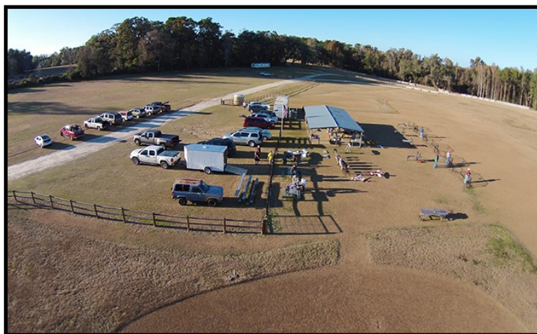
A View from Above