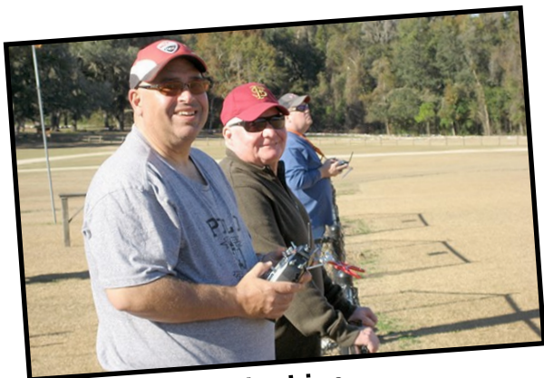
On the Line