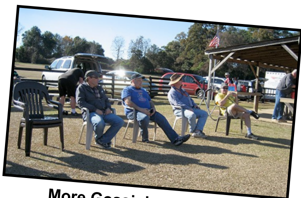
More Gossiping than Flying