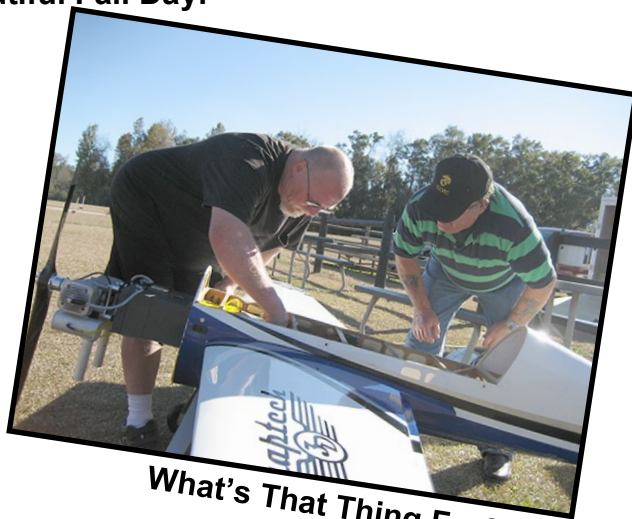
What's That Thing For?