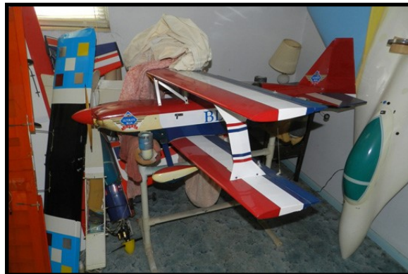
A nitro Ultimate Biplane is one of the aircraft to be auctioned