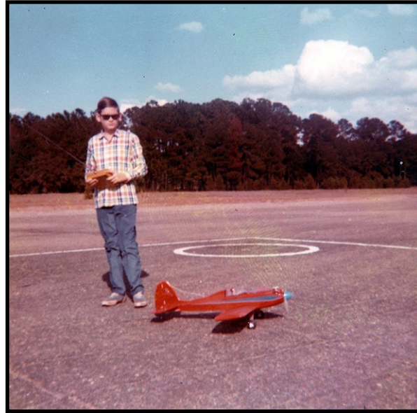
A young club member at Dale Mabry Field in 1970

Time flies when you're having fun! But we need to hit the pause button and look back after fifty years. Our club has a rich history of struggles, triumphs, generosity, dedication and community service.