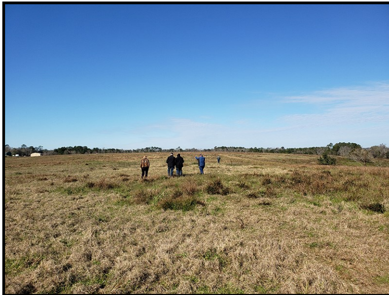
Seminole RC Club officers inspecting the spacious area where our new runway will be located.

Our club is officially 50 years old this year. We will kick off our 50 th year with a celebration day event on Saturday, March 9 with great food, fun, raffles and more. For seafood lovers, we will feature a low country boil and for landlubbers we will have hot dogs and hamburgers. These delicacies will be available for five dollars per person.