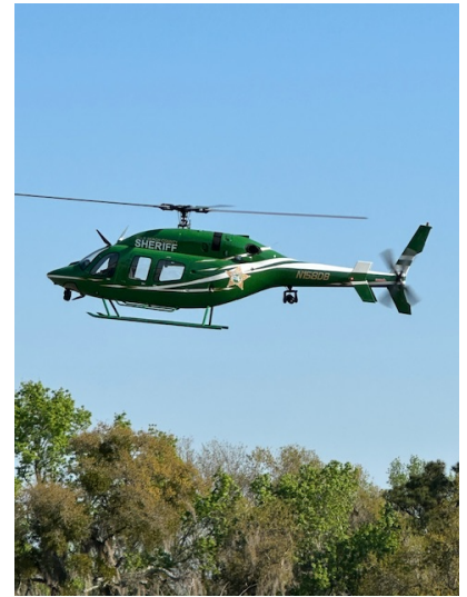
Left - The training fleet. Center and below - some crowd pics. Right - Sandy Jaffe's scale helicopter.