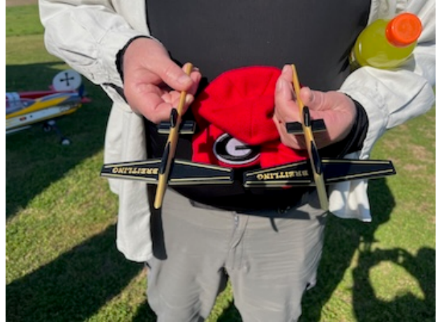
Two beautiful two-color practice planes printed by Randy Reese.