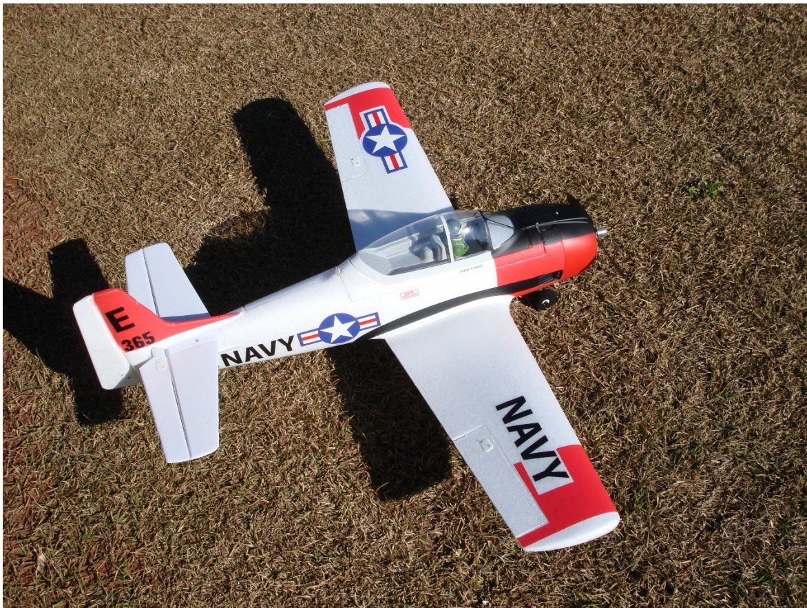
Ol' Reliable on Monday, December 20th 2010, ready for its 82 nd flight.