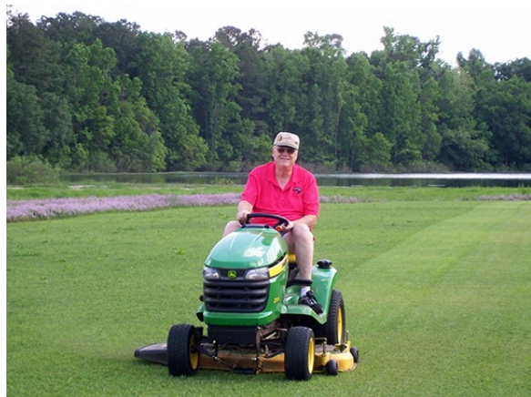
It'll never get off the ground!