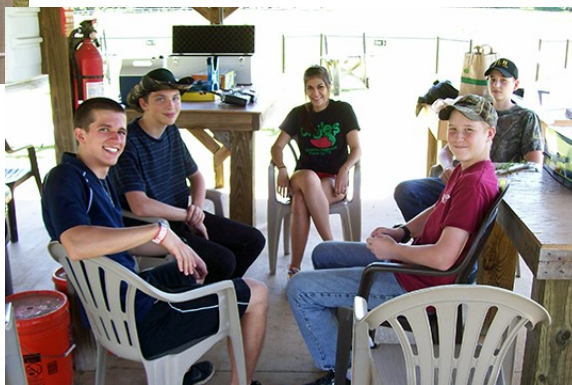
Civil Air Patrol Cadets