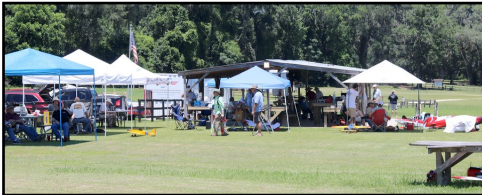
2017 Memorial Weekend Event

In less than a week, our annual Memorial Day Weekend Fly-In event will be here. It is next Saturday, May 26 th , 10:00 AM until dark. All types of aircraft are welcome, but we would like to see as many warbirds as possible.